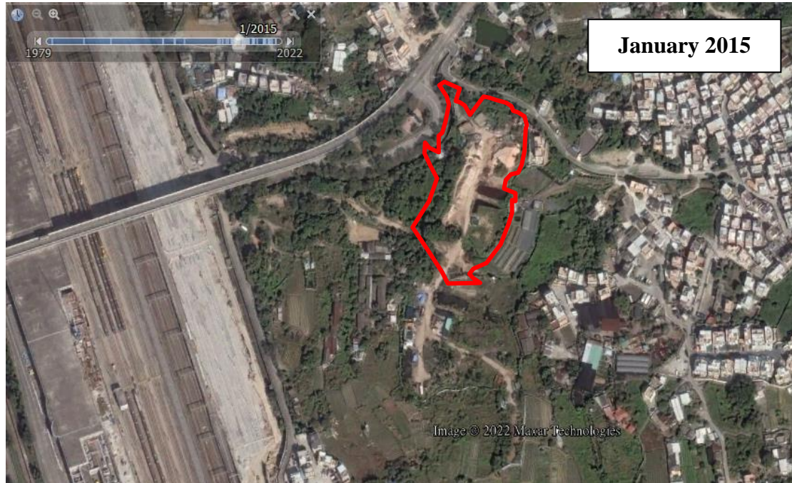
Figure 1-9 This application site (marked in red) has been subject to land formation and vegetation clearance. It is suspected that this is a case of “destroy first, build later”